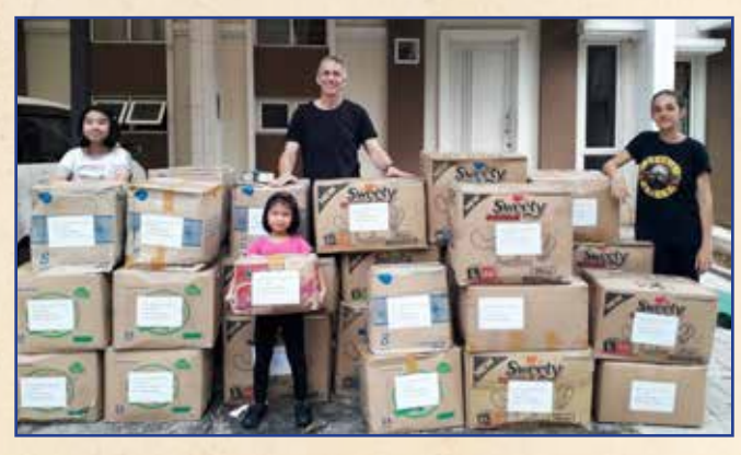
Boxes ready to ship to Atambua

This month we shipped 34 boxes of donated items to Atambua in preparation for our trip in August. Thanks to Softex Indonesia for donating adult diapers and sanitary napkins as well as other sponsors for donating clothing for this shipment.