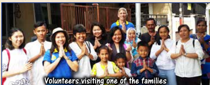
Volunteers visiting one of the families

Every year during the Idul Fitri Muslim holidays we visit the homes of former street children who are studying with the "Sahabat Anak" organization. This organization of young volunteers provides education for street children to get them off the streets and helps them to get back into the educational school system. The children usually live in very poor areas of Jakarta . On the main day of Ramadan our group of volunteers consisting of 6 to 10 people goes house to house to visit the families of these ex-street children. They don't like to be called "street children" since they are no longer on the streets but are getting an education. Many of them have some amazing stories that are heart breaking and tremendous success stories.