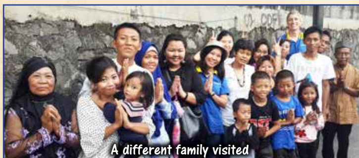
A different family visited

Every year during the Idul Fitri Muslim holidays we visit the homes of former street children who are studying with the "Sahabat Anak" organization. This organization of young volunteers provides education for street children to get them off the streets and helps them to get back into the educational school system. The children usually live in very poor areas of Jakarta . On the main day of Ramadan our group of volunteers consisting of 6 to 10 people goes house to house to visit the families of these ex-street children. They don't like to be called "street children" since they are no longer on the streets but are getting an education. Many of them have some amazing stories that are heart breaking and tremendous success stories.