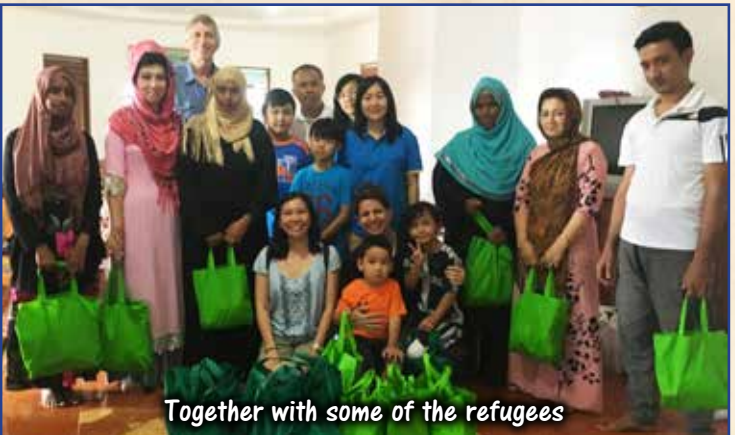
Together with some of the refugees

The refugees are not allowed to work and so have to rely on concerned people to provide basic food necessities. One family we visited was a couple with 5 children from Afghanistan who were desperate to get daily food for their family.