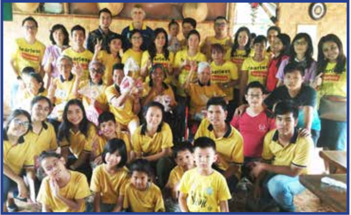
Group picture all together

Our team of volunteers visited a home for the elderly and orphanage in BSD, Tangerang . Thanks to Softex Indonesia we provided personal hygiene supplies for residents of the center. We all played games, sang songs and enjoyed a wonderful meal together.