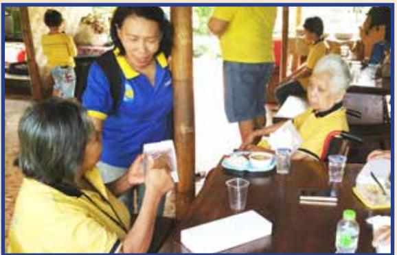
Fivie helps to deliver goods to elderly