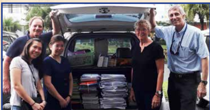
Picking up donated books to give to those in need