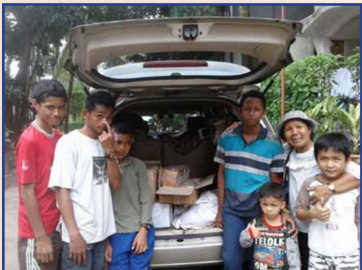
Goods being delivered to the orphanage