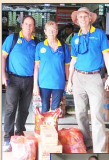
Team with goods

On our way back to Jakarta from Atambua our team stopped for a few days in Bali to visit the “ Casa Vida ” shelter for abused children in Denpasar. Thanks to sponsors we provided food staples for the center and a gift package for each of the children. We took time to interact with the children and staff by singing songs and having an English activity with flash cards.