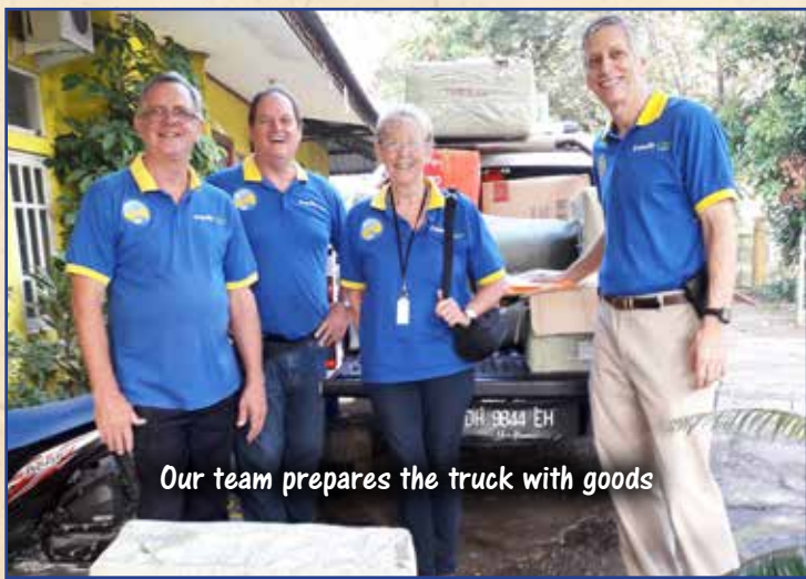
Our team prepares the truck with goods