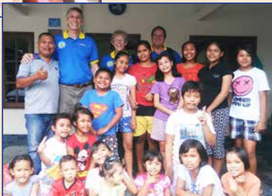
Group shot with children & staff

On our way back to Jakarta from Atambua our team stopped for a few days in Bali to visit the “ Casa Vida ” shelter for abused children in Denpasar. Thanks to sponsors we provided food staples for the center and a gift package for each of the children. We took time to interact with the children and staff by singing songs and having an English activity with flash cards.