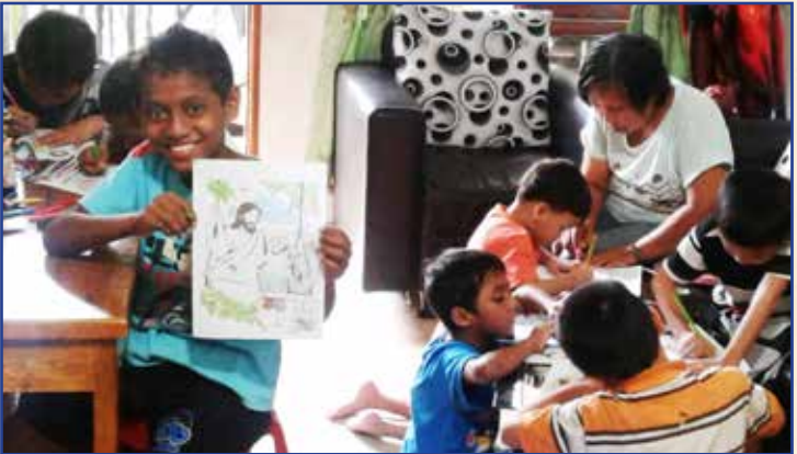
Children having fun doing activity together