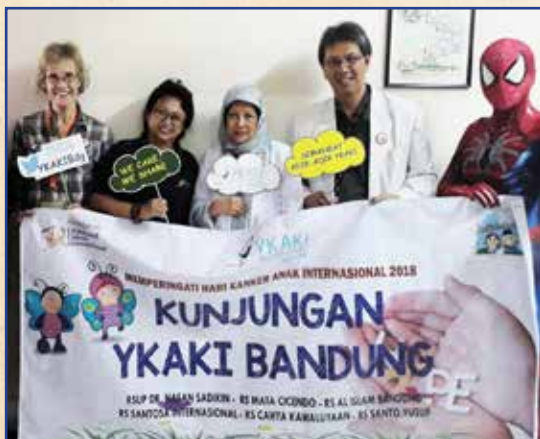
together with some of the doctors and Spiderman