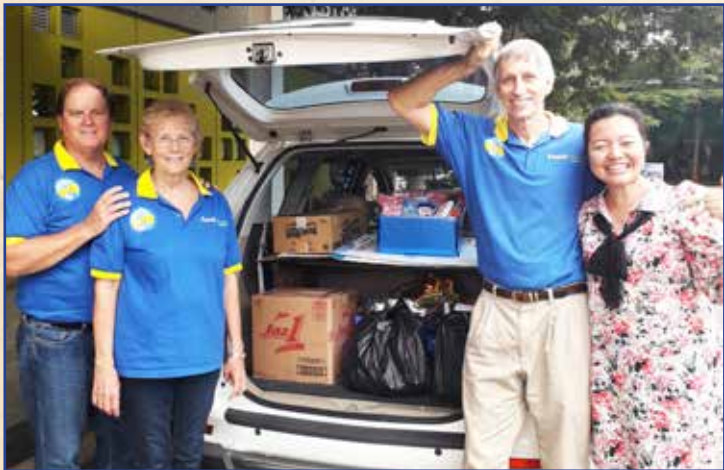
Our team with one of the BINUS teachers and goods donated

Volunteers working together with BINUS School Serpong collect donated items to be distributed to the needy areas. The food items were delivered to YAI Center for children with Cancer. The nonfood items will be distributed next month to Sahabat Anak and organization that works with former street children.