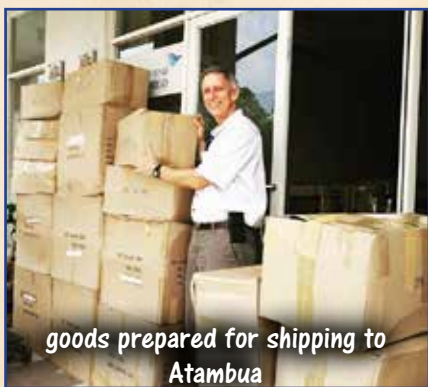
goods prepared for shipping to Atambua

We have a team of four volunteers preparing to go to Atambua, Nusa Tenggara Timor . Thanks to sponsors we have collected 400 Kg. of donated clothing and are shipping it to Atambua for when our team arrives.