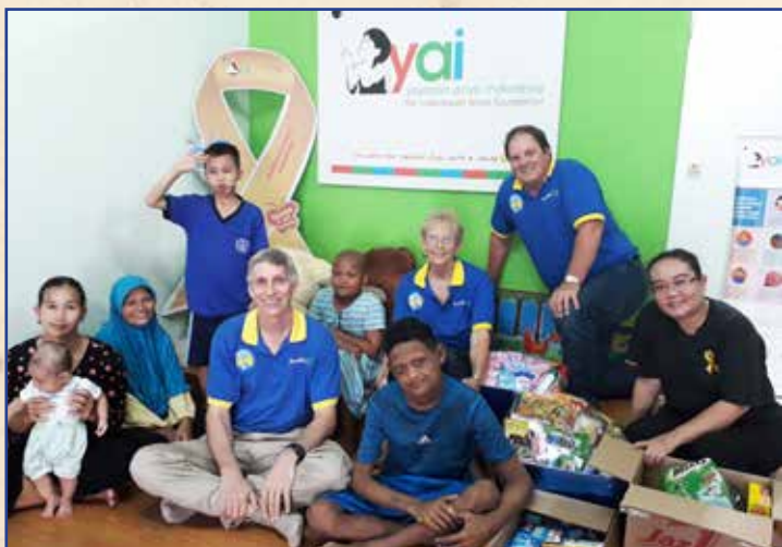
All together with children, parents and staff

Our team in Jakarta visited YAI (Yayasan Anyo Indonesia) Center to deliver donated items and interact with the children. Special thanks to BINUS School Serpong for donating the items.