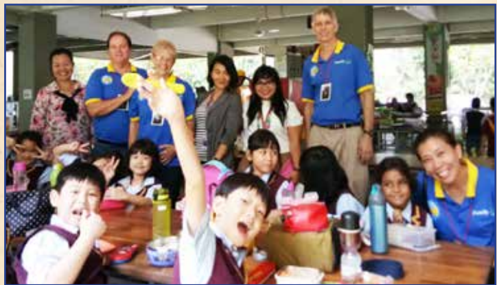
Spending time with some of the children at BINUS during their lunch break